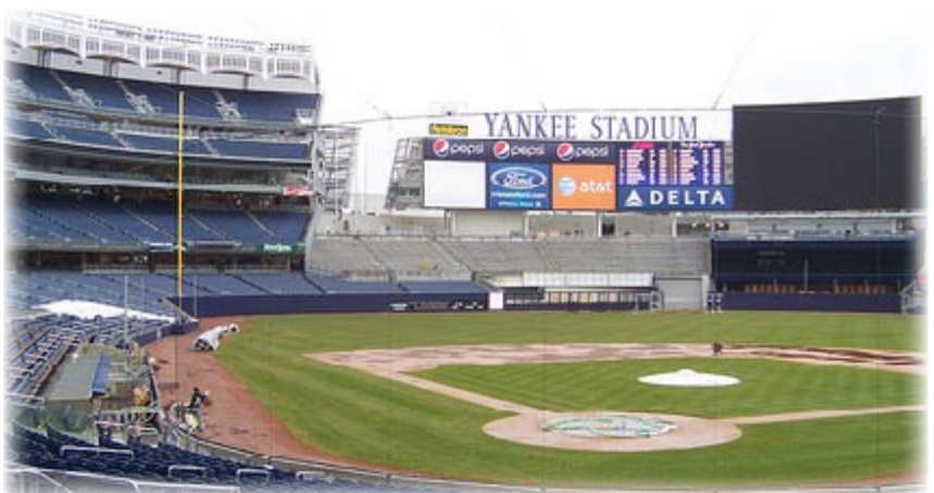
Yankee Stadium infield as seen from the bleachers

Across the street from the new Yankee Stadium sits its quiet, empty predecessor, whose demolition is eminent and will be no small task. Rather than attacking with a wrecking ball and dynamite, skilled welders will dismantle the landmark piece by piece with cutting torches . AWISCO (Maspeth, NY) will provide the massive volume of welding gas necessary for the project. After helping with the demolition of Shea Stadium, former home of the New York Mets, last year, the AWISCO team is up to the task. The Shea demolition involved eight Micro Bulk Pack Cradles from